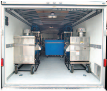
Rear View: Back to Front

If you're a large water-loss restoration company with one or more losses coming in a day, this trailer and tes package is for you! Equipped with three "tes - High Speed Structural Drying Systems" and an X-treme Extractor will mitigate up to three jobs at one time.