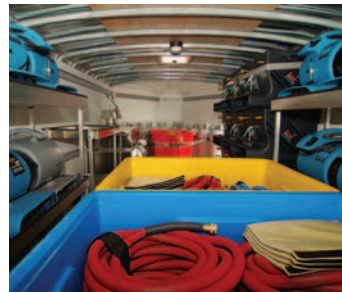
Middle View: Back to Front