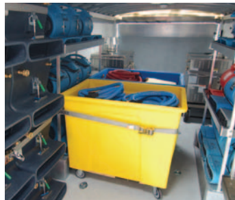
Middle View: Front to Back