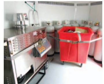
Front of Trailer