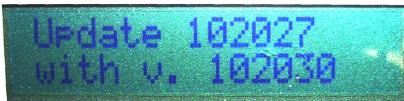
SOFTWARE UPDATE SCREEN

Computer Serial Port for E-TES SD manufacturer use only, used for testing and formatting of microprocessor